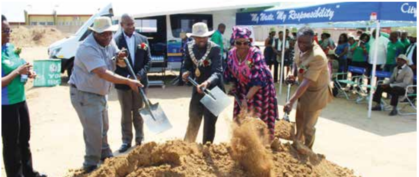
All medical waste should be correctly disposed off

The City of Windhoek is currently constructing two medical waste treatment facilities in the northern industrial area in Newcastle Street at a cost of N$50 million which marks yet another milestone investment in the city's quest to adequately manage the waste generated by our health and medical facilities. The facility is expected to be fully operational in June 2016.