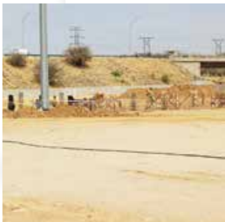
The construction of the medical incinerator located in Newcastle street in the Northern Industry Area

The facility will manage all medical waste within the City's boundaries, but also render assistance to the surrounding towns such as Rehoboth, Gobabis and Okahandja. The facility is also expected to serve as a skill transfer centre, as it will be open to other local authorities, to gather experience and expertise in the sustainable management of medical waste. This in turn will positively impact how waste is managed in the whole country.