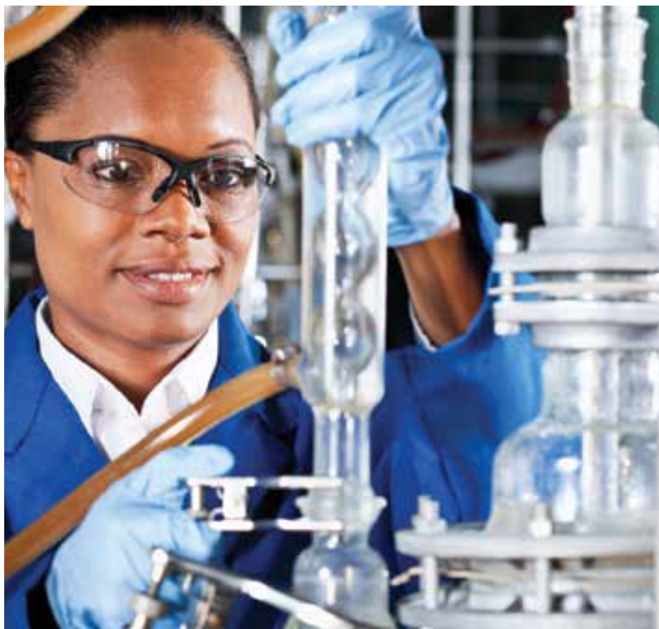
For illustration purposes: Laboratory technician testing the water quality.

Lastly, let me remind you of the exciting entertainment news of the hosting of the Windhoek Jazz Festival 2015 scheduled to take place on the 24th October 2015 at the Hage Geingob Stadium. This year's festival will feature, Jonathan Butler, a renowned international Jazz artists who