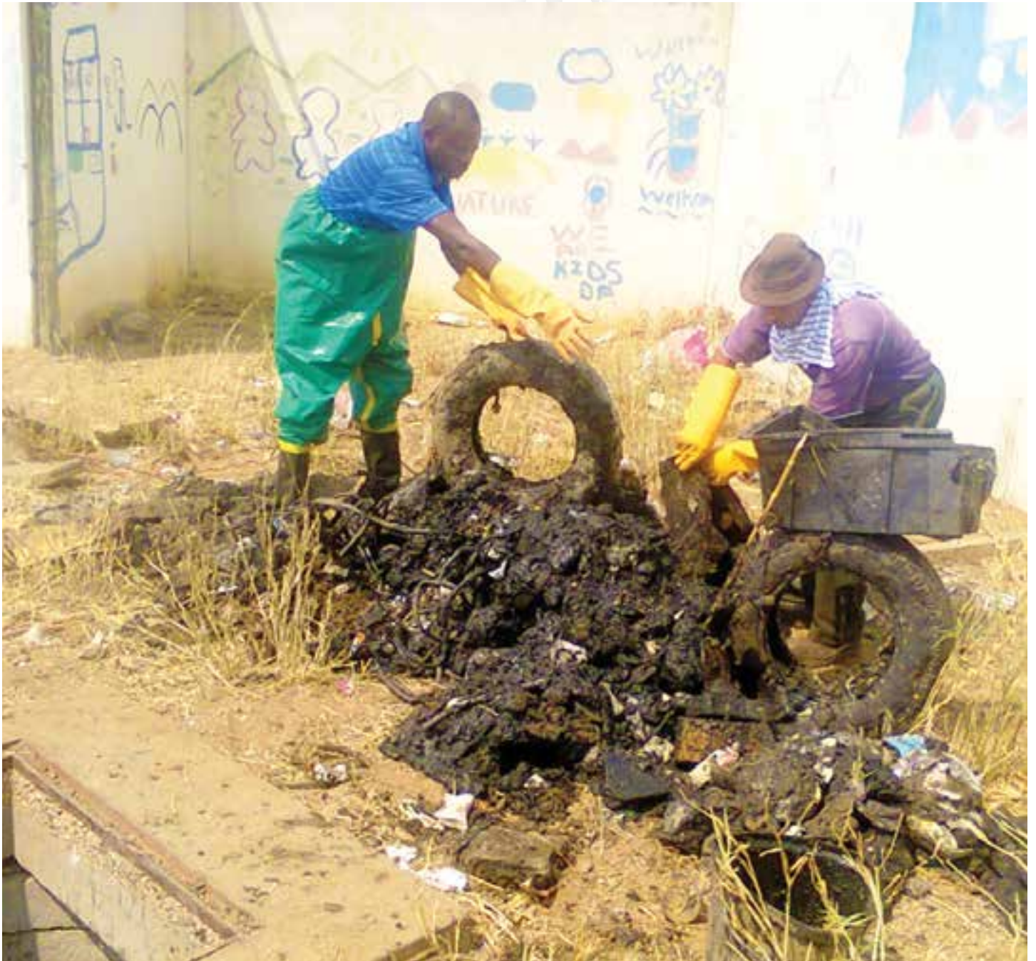
Illegal act... the unauthorised waste materials being removed from a municipal manhole in the northern western suburbs.

The above picture demonstrates how misuse of sewer systems by the public, remains one of the major causes of frequent blockages, especially in the north-western suburbs. Unauthorized materials are put into the system through toilets